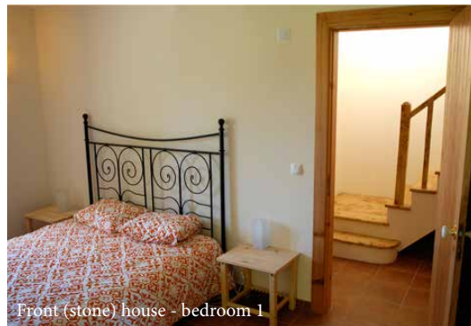
Front (stone) house - bedroom 1