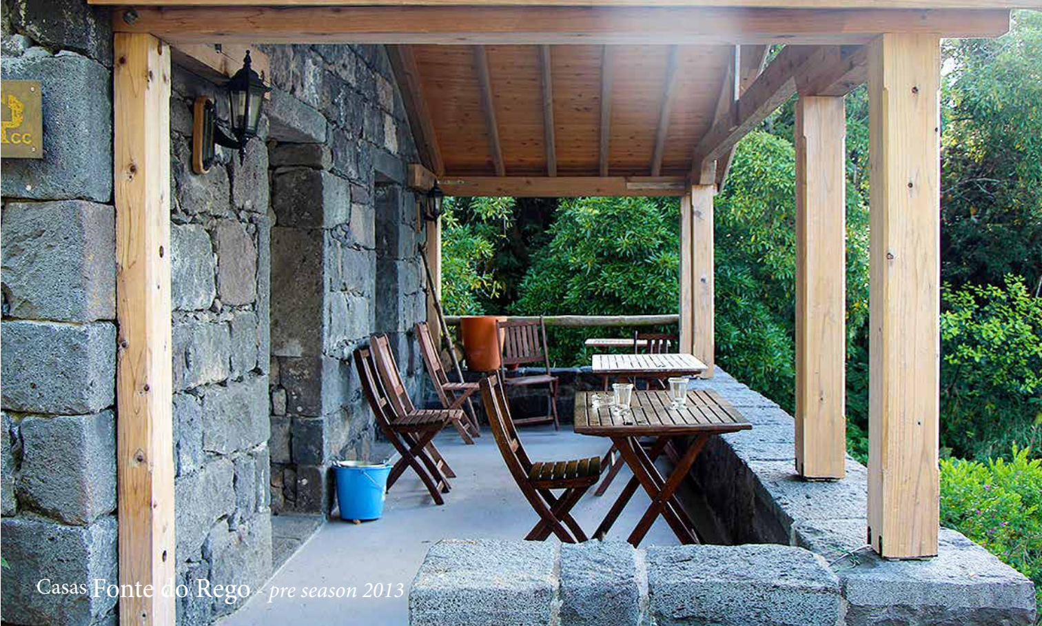
Casas Fonte do Rego - pre season 2013