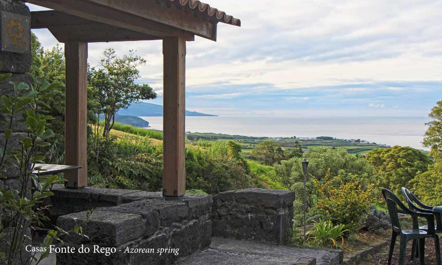
Casas Fonte do Rego - Azorean spring