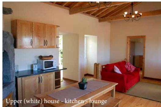
Upper (white) house - kitchen - lounge