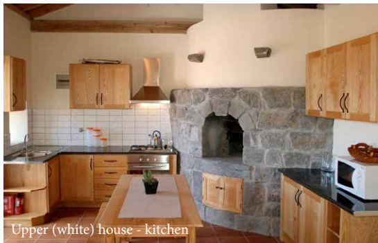
Upper (white) house - kitchen