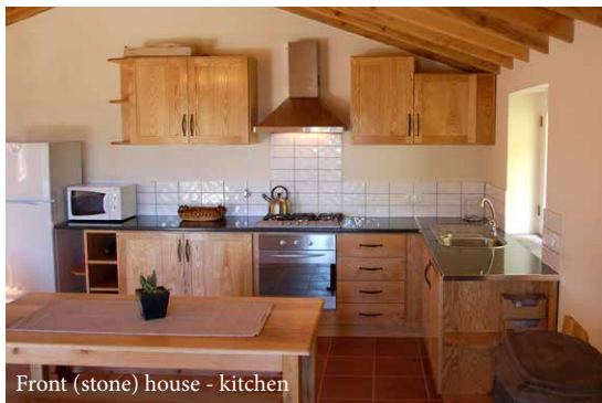
Front (stone) house - kitchen